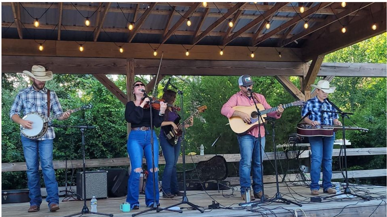
Lonesome Heart Bluegrass Band