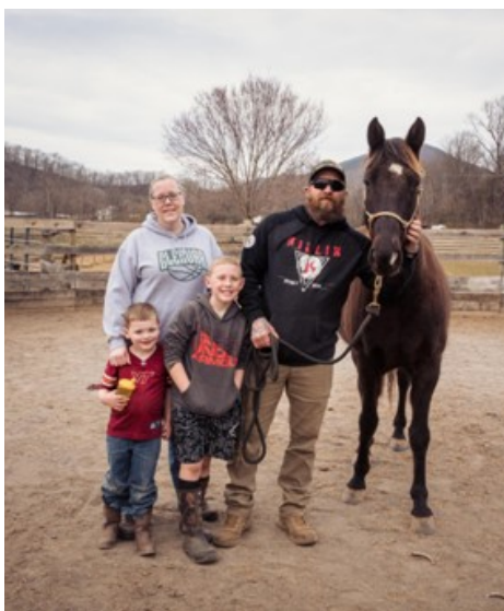
A veteran and his family